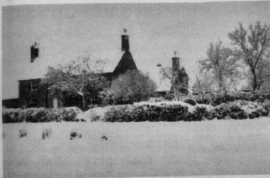
The Lunch Stop

NORTH WILTS FUN RUN - 19 July by Chrow Radish