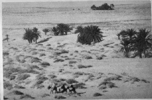
Plenty of room to park at the rally site.

Despite our best efforts we did not manage to lose anyone on the torturous course through the wilds of Wiltshire. Snow chains and four wheel drive were a help, diff. locks and active suspension a distinct advantage to ascend the 203 metre summit. The pith helmets and