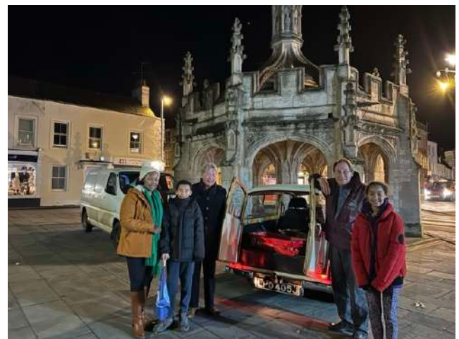
Hamper arriving in Malmesbury

Please bring any contributions to the Christmas picnic on 11 December. The hamper will be delivered to the Food Bank at Swindon Night Shelter at 11:00 am on Friday 16 December, with Father Christmas in attendance. Please join us with your Minor. The address this year is BEHIND the school: The Lyndhurst Centre Lyndhurst Crescent Park North Swindon SN3 2RW Tea, coffee and biscuits will be available.